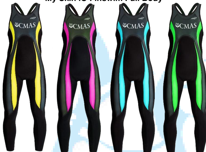
My Skin iO Finswim Full Body