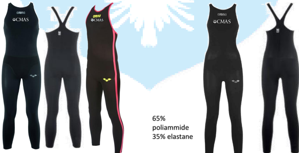
Evo + for Man