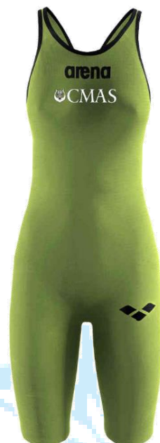
- Carbon PRO Closed back - Carbon PRO Open back