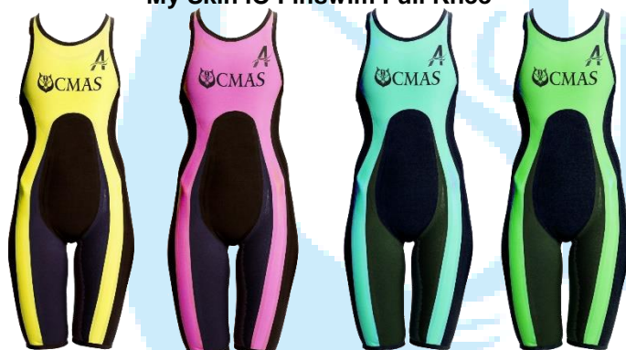
My Skin iO Finswim Full Knee