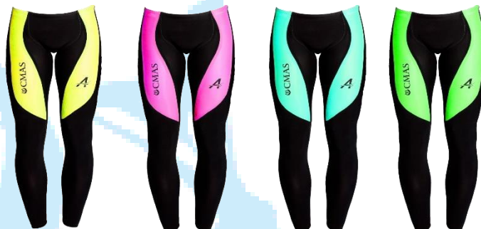
My Skin iO Finswim pants