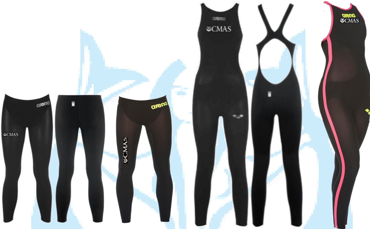
Woman Full Body open back